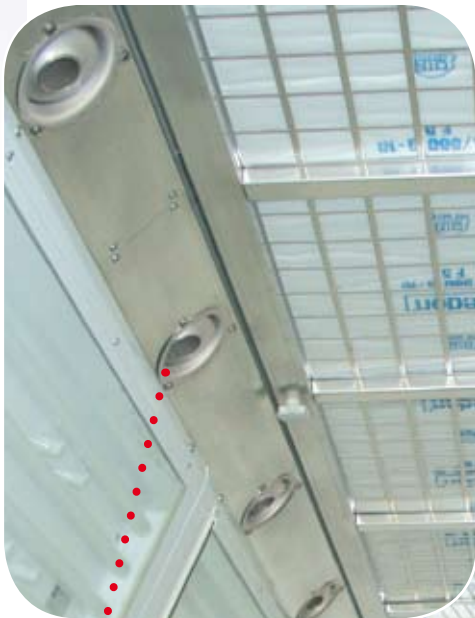
Multi-Air well visible the air nozzles of the system

accelerated and in many cases, the result is improved. Especially when evaporating water-based paint, time saving can be up to approx. 70 % compared to the conventional method. Here, Multi-Air is a decisive advantage.